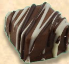
Triple Decker 3-layer (dark, milk & white) chocolate ganache