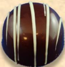
LemonVender lemon lavender ganache