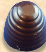
Sunny Bee honey lemon ganache