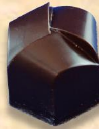
Mochaberry mocha strawberry ganache