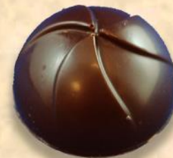
Vanilla au Naturel natural vanilla ganache