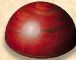
Raspberry Gem raspberry ganache