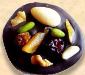
Mendiant chocolate disk with nuts & dried fruits