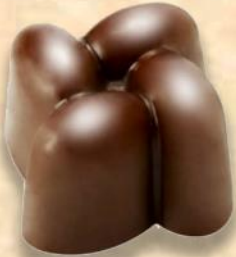
Cherry Blossom cherry ganache