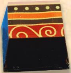
Amaretto Azteca amaretto ganache