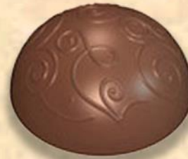
Pear Gingerly pear ganache with chopped ginger bits