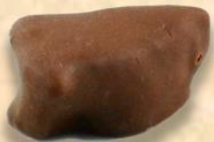
Sweet Ginger candied ginger