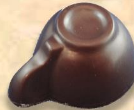
mmMocha mocha ganache