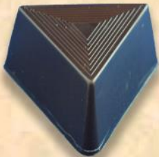
Lemon Cheesecake lemon-yogurt ganache