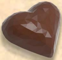
Blueberry Amore blueberry ganache