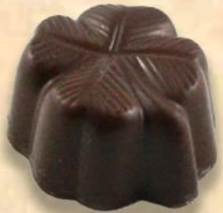
Bailey's Charm Irish cream ganache