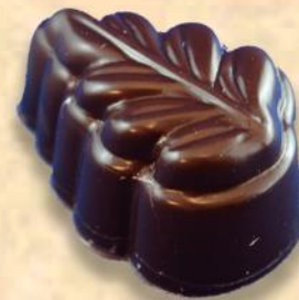
Magical Mint mint-infused ganache