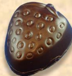
Strawberry Fields strawberry ganache