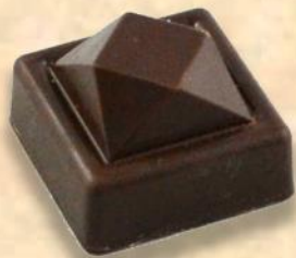
Marnier Mirth Grand Marnier ganache