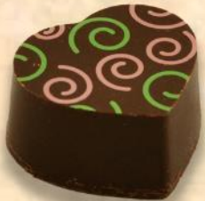
Guavatation yogurt ganache with guava jelly